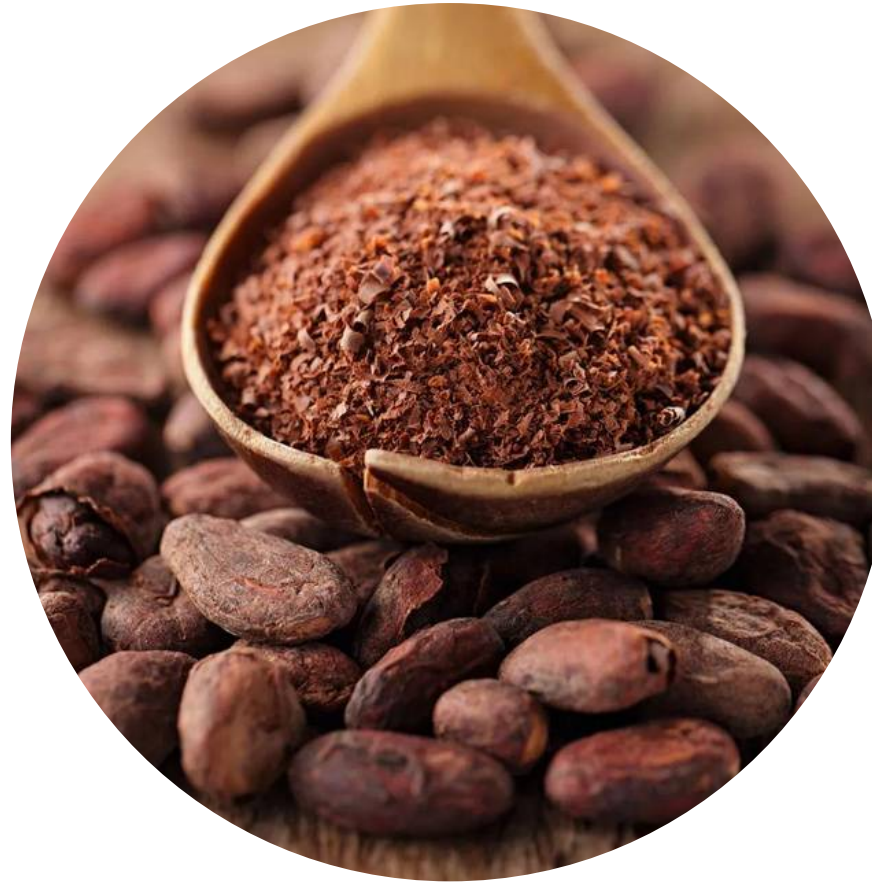
Beans and Powder